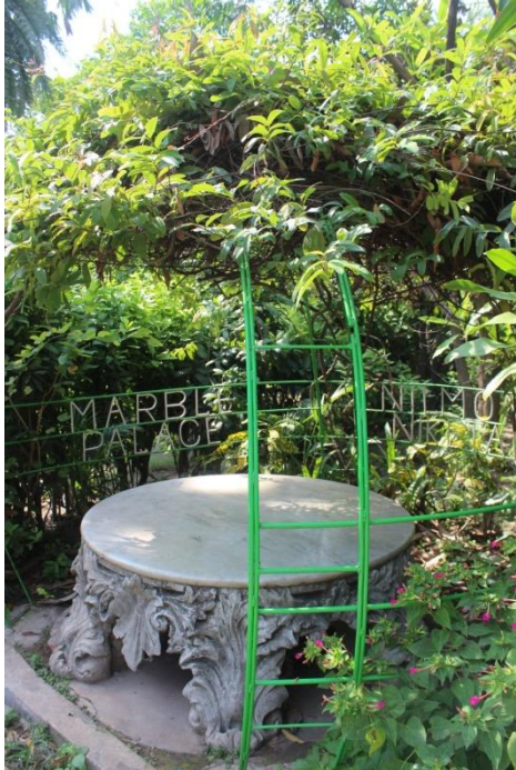
Visitors can sit and relax

There are sitting areas and benches where people can sit and relax.