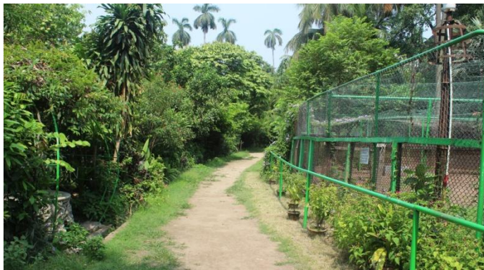
The Deer Enclosure.