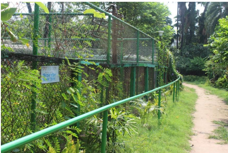
The deer enclosures.

The Marble Palace Zoo being a mini Zoo is only concerned and concentrated upon the well being of the animals and birds. It is the foremost and the most important objective of the zoo. Other objectives of the zoo is spreading of conservation, education and creating awareness among the people.