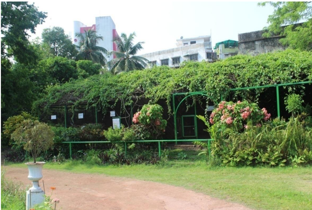
The Zoo Premises