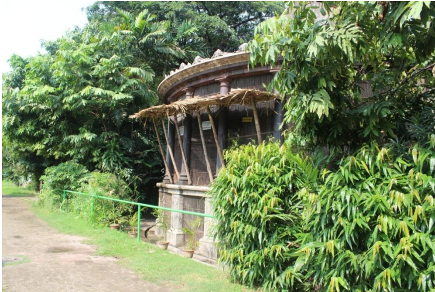
The heritage cage structures

The visitors can have a combined and enriching experience of the lush heritage so provided by the Art gallery with that of the livelihood of the animals and birds.