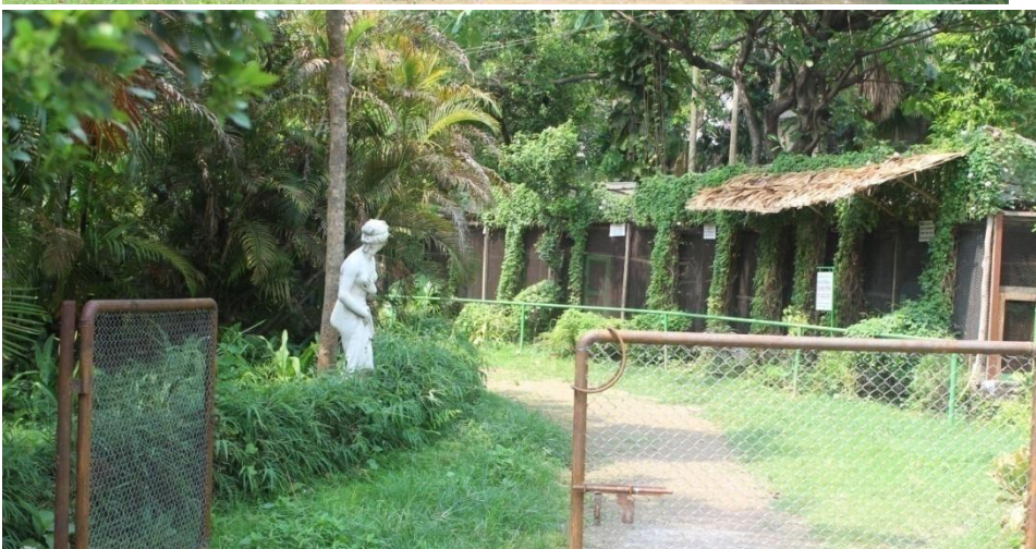
The bird enclosures.