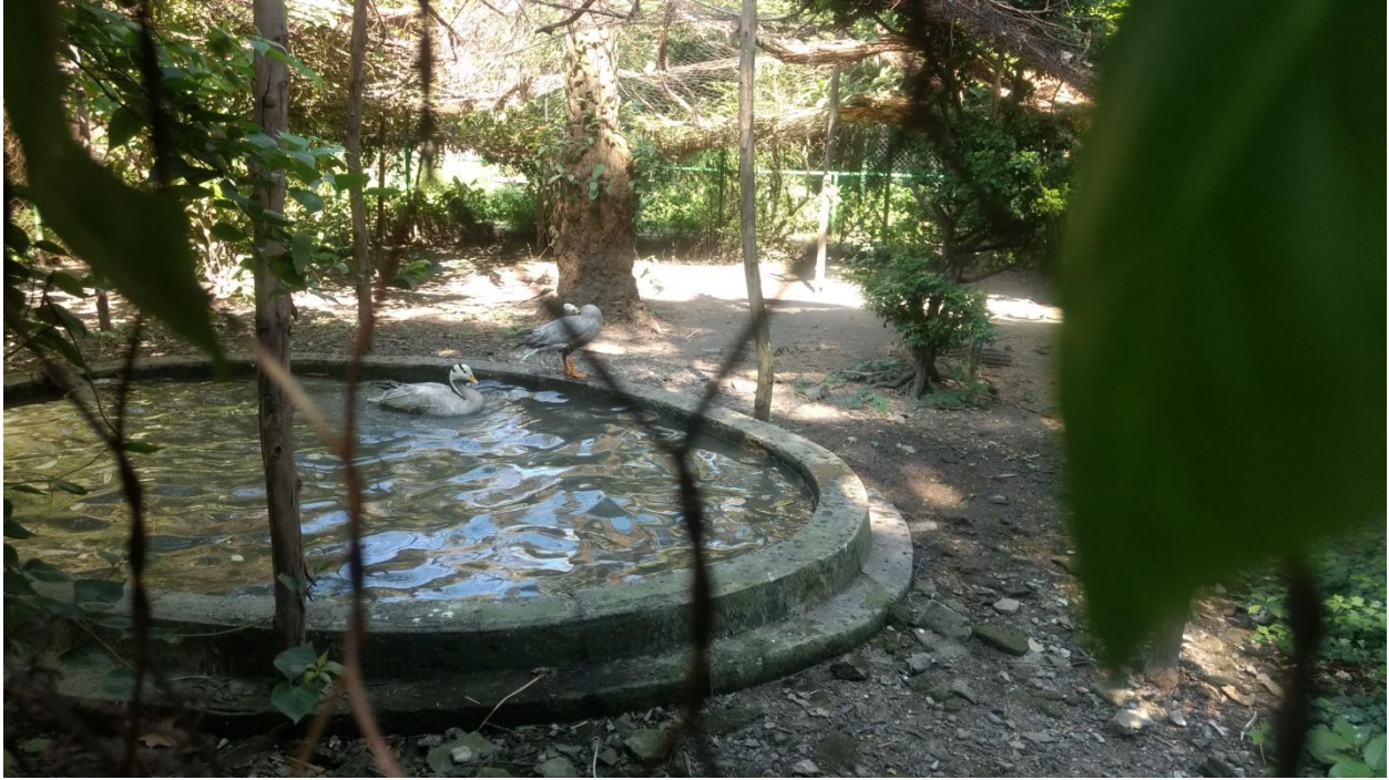
The Duck Enclosure

As the inventory report of the birds and animals including births and deaths are being sent to the Central Zoo Authority regularly, we are not reporting the same in the annual report.