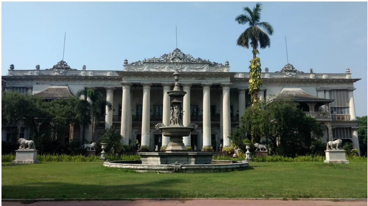
The Marble Palace Zoo and Marble Palace Museum and Art Gallery.

The zoo is privately maintained and it is a prized achievement of the house. In accordance to the Central Zoo Authority improvements has been brought. Since the zoo is within the heart of the city of Kolkata, people get the experience of the richness of the wildlife as purely as possible. Students' of various schools and colleges under many universities come to the zoo and are greatly enriched with the knowledge of the animals and birds.