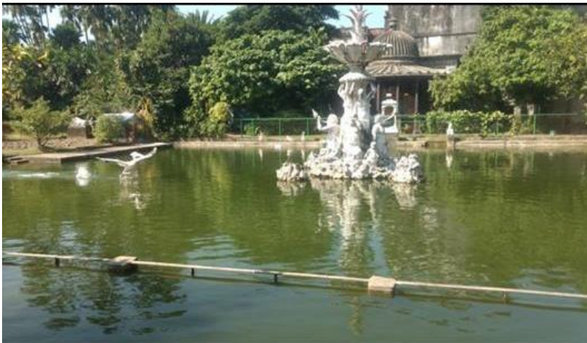
The pond enclosure where ducks and pelicans swim.

Ducks and Pelicans are able to swim freely in the enclosed pond area.