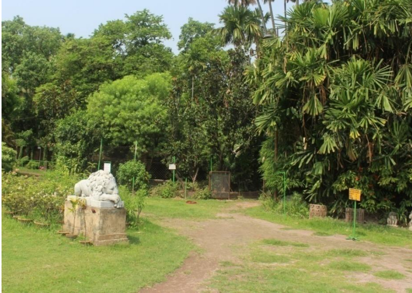
Way to the Zoo.

We, the Marble Palace Zoo Authority are of the opinion to provide the best kind of habitat that can be provided to every animal in natural lifestyle.